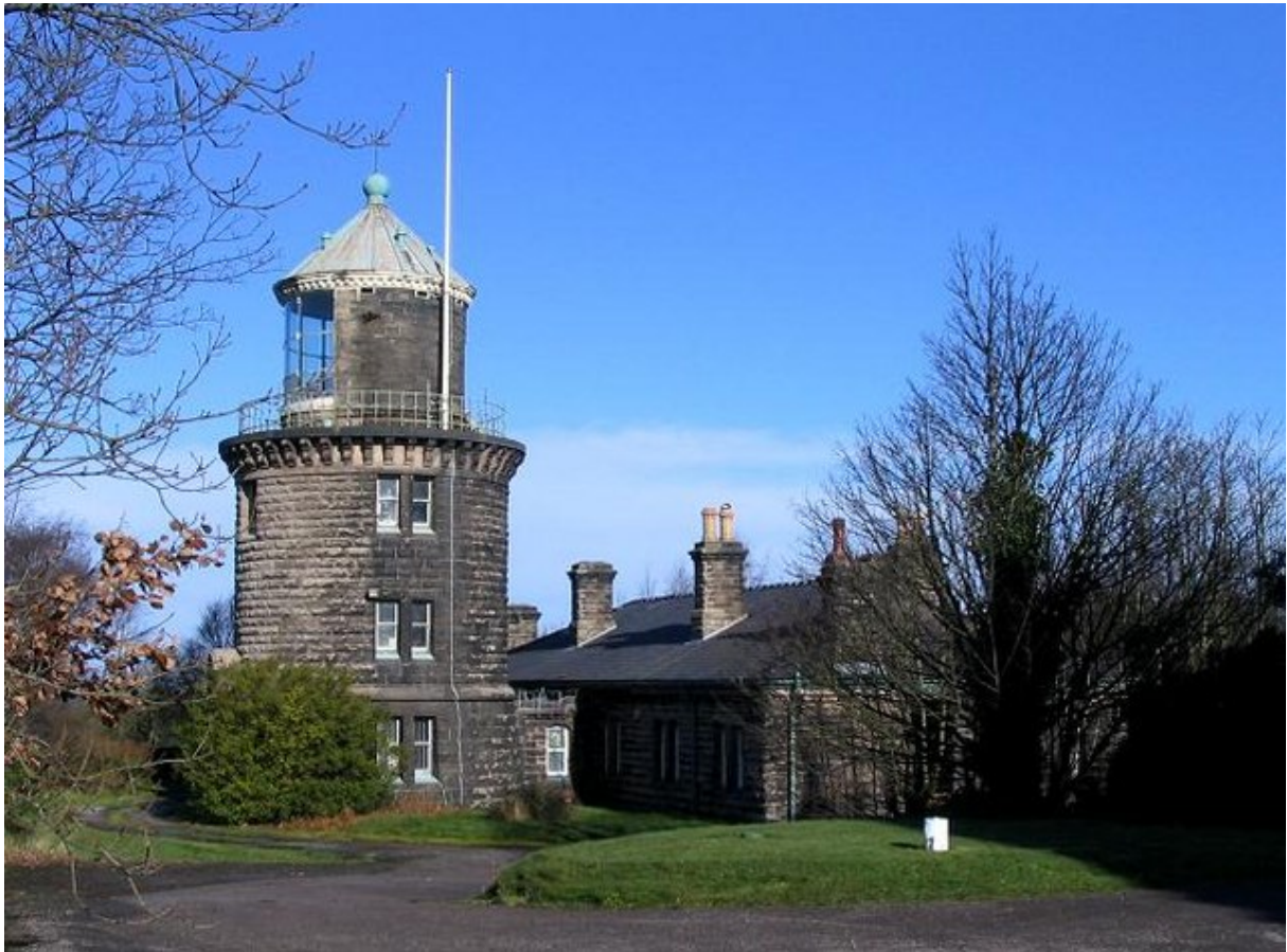
Figure 1. View of Bidston Lighthouse from the private road. Number 3 is out of sight at the rear.

From either station, allow 20-30 minutes for the uphill walk to the lighthouse. The prettier walk is from Bidston Station via Boundary Road.